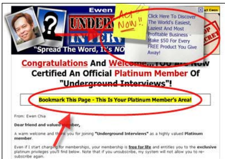
Diagram 4: Johnson Boxes And Instant Attention www.UndergroundInterviews.com

There you are, now go profit from your thank you pages!