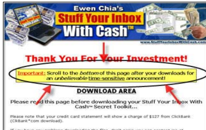
Diagram 2: To Promote Another Site www.OutsourceSecrets.com